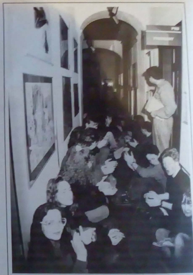
SU President addresses the protesters

were changed in late 1991 when a the Discipline Appeals Committee recommended that letters to students informing students that are being charged with an offence under under the code of conduct should also inform them of these rights.