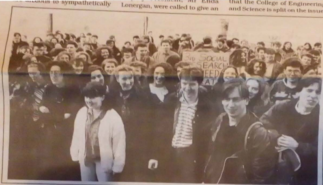
UL Students protest about repeats outside Plassey House