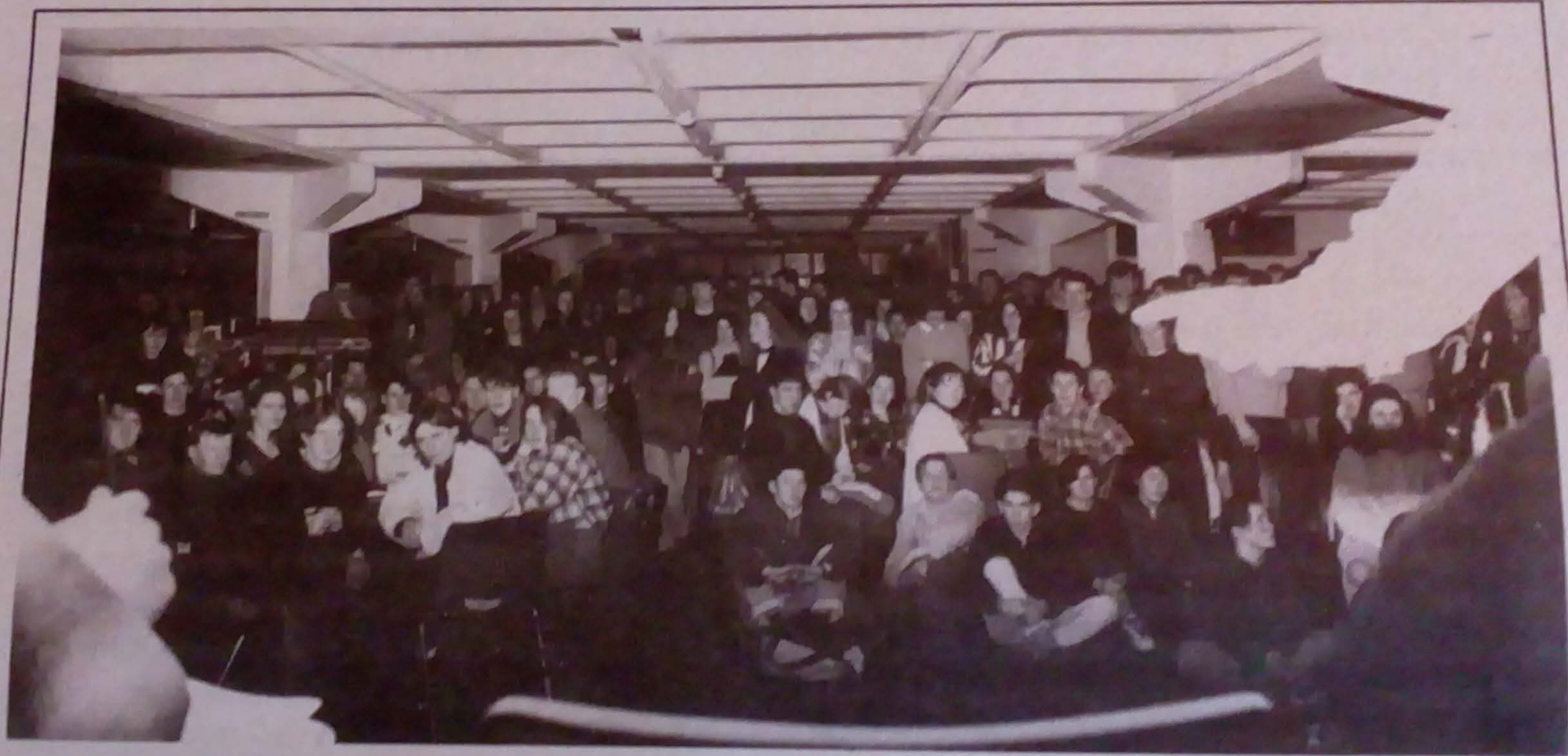
Union Meeting in Canteen prior to Whitehouse Occupation