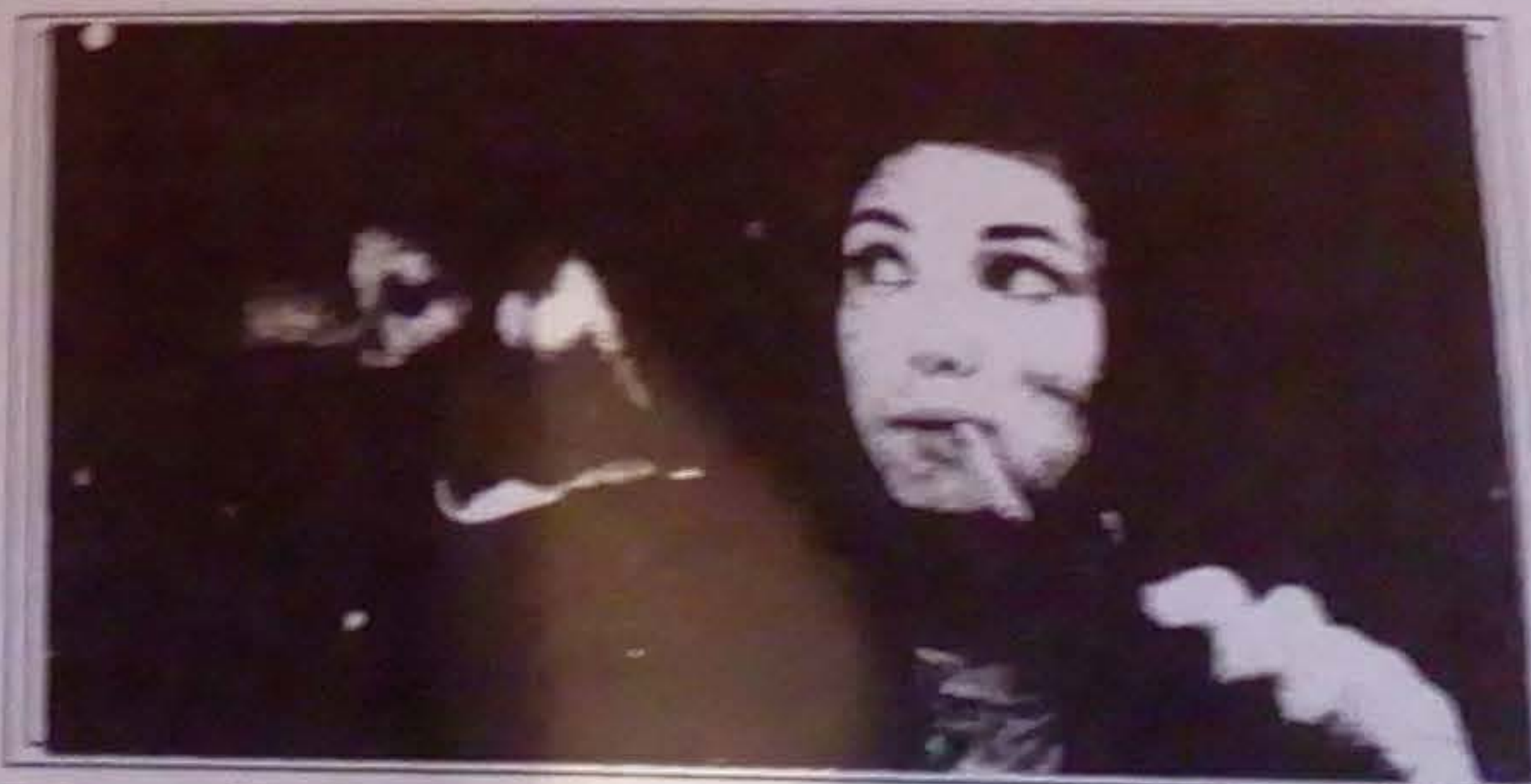
Winona Ryder in Jim Jarmusch's Night on Earth

The film has all the style and technical wizardry one would expect from a Greenaway film - it has been described as Renaissance MTV - and if it is, so what! Shakespeare will never be the same again!