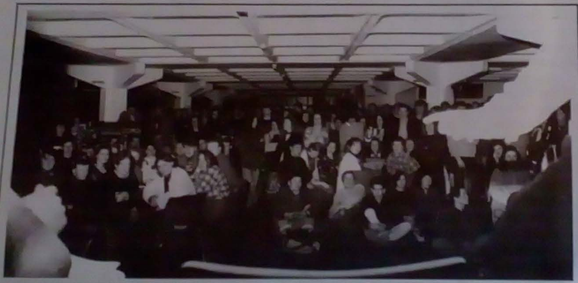
Union Meeting in Canteen prior to Whitehouse Occupation

The students applied to the Students' Union for legal representation for that hearing. In addition to presenting the facts of the case at the hearing last week, the legal representative also argued that the case should be dismissed for a series of legal reasons. Among these were the facts that before the first hearing the students weren't informed of their right to have legal representation or of their right to cross-examine witnesses. The University's discipline procedures were changed in late 1991 when a the Discipline Appeals Committee recommended that letters to students informing students that are being charged with an offence under the code of conduct should also inform them of these rights.