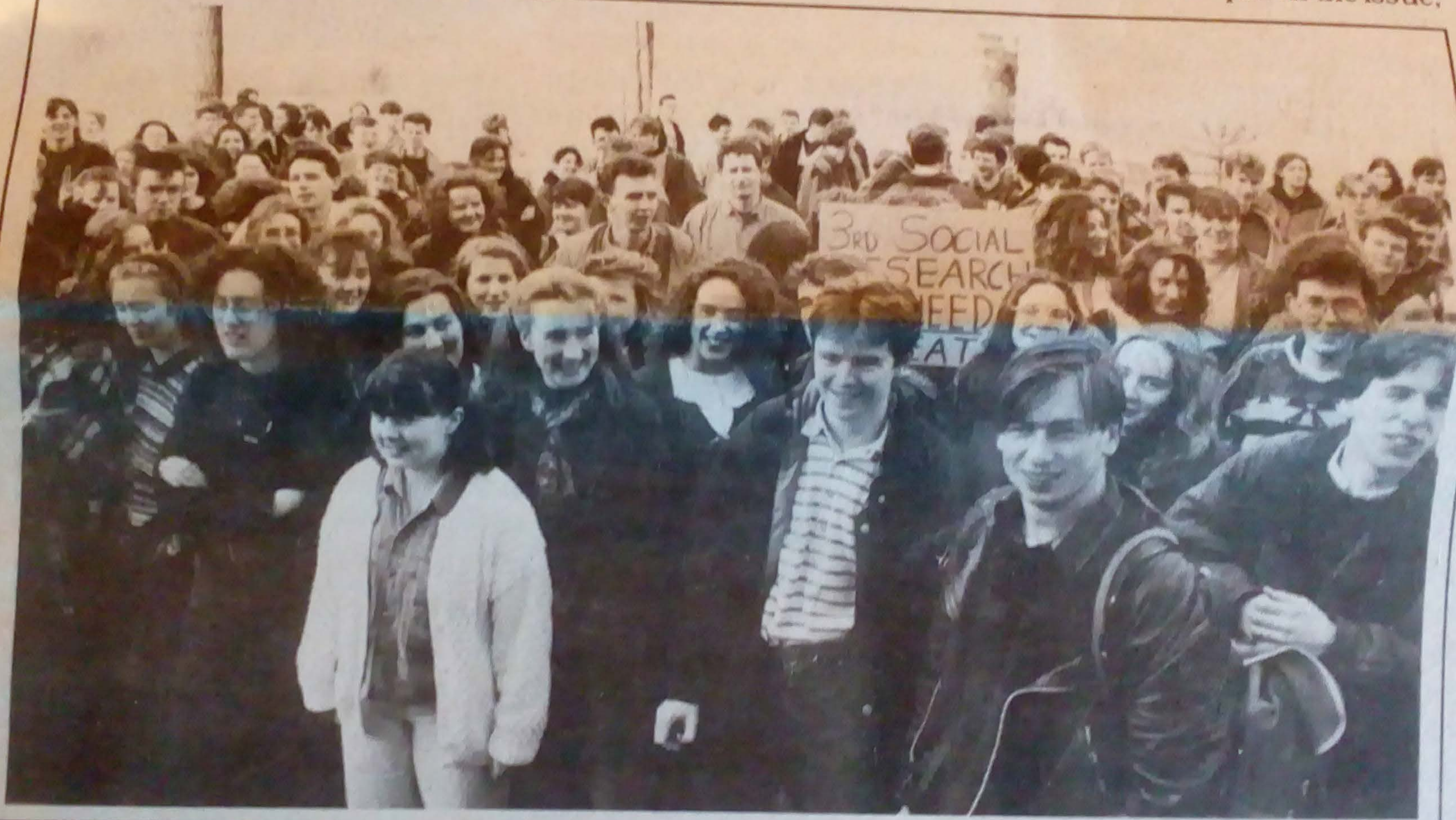
UL Students protest about repeats outside Plassey House